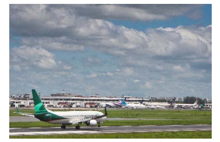
3 hazrat shahjalal international Airport

Three international airports in Dhaka, Chittagong and Sylhet serve as the gateway into Bangladesh. Some of the world's largest airlines land and take-off from there every day. These airports handle domestic flights as well. Besides there are 7 airports in Bangladesh which handle domestic flights exclusively. Located by the banks of the Karnaphuli river Chittagong is the main seaport of Bangladesh. It handles almost 90% of Bangladesh's exportimport trade. It is used for transshipment by India, Nepal Bhutan as well. With and references in Ptolemy's Map of the ancient Greco-Roman world it is one of the oldest seaport in the world. In the fiscal year 2019-2020 approximately 68.47 million metric ton of bulk cargo was handled through Chittagong port which is a 6.54% growth from previous year. Surrounded by the largest mangrove forest