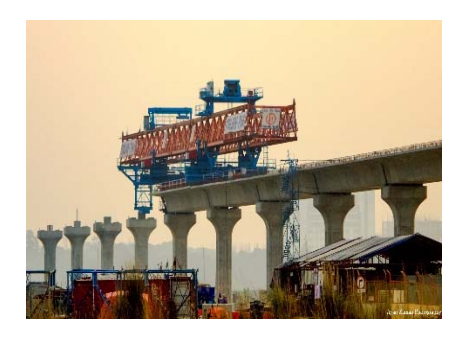
5 DHAKA METRO RAIL UNDER CONSTRUCTION

4 CHITTAGONG PORT surrounded by India in the North, East and West. Trade with India is mostly conducted through the 13 land ports located on the border Bangladesh-India in Benapole, Teknaf, Sonamasjid, Banglabandha, Hilli, Darshana, Birol, Burimari, Tamabil, Haluaghat, Akhaura, Bibirbazar and Bhomra. Beanpole in Jessore district is not only the largest land port in Bangladesh but in South Asia as well because of its proximity to Kolkata (formerly Calcutta). 90% of the Bangladesh-India trade happens through here.