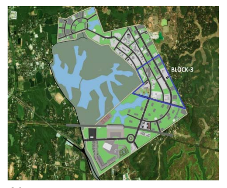
41 BANGABANDHU HI-TECH CITY BLOCK III

BTL has all but completed the development of the signature Main Terminal Building (MTB) of Block III. The 216,000 square feet Solaris Building has eight floors and a basement with parking facility for hundred cars. It has