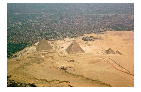
19 PYRAMIDS OF GIZA IN EGYPT

18 AHSAN MANZIL IN DHAKA Cambridge and Oxford, to which the world looks again for yet another innovation to save humanity – the Coronavirus vaccine; Japan build an industrial superpower from the ruins of the Second World War; Germans unified and tore down an old structure and a legacy of the Cold War - the Berlin Wall; the