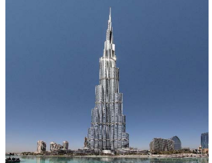
31 BURJ KHALIFA, DUBAI, UAE

move the wheels of Industrial Revolution 4 forward for a better future for all. Established over 232 acres of land it is divided into 5 blocks. Block 1 is being developed by the government while the remaining 4 blocks